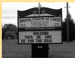
DE SRD held at Smyrna Church of Christ and Christian School, May 1, 2010.

categories used at chapter level are used to determine these winners. TOPS provides certificates for these